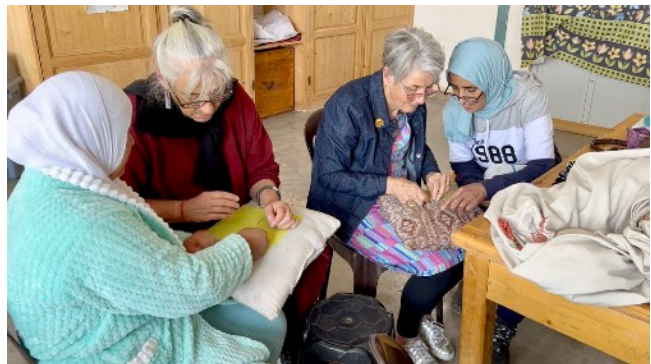
PHOTO: Tiwisi Embroiderers Association workshop

Guesthouse on FB to include all 3 meals.