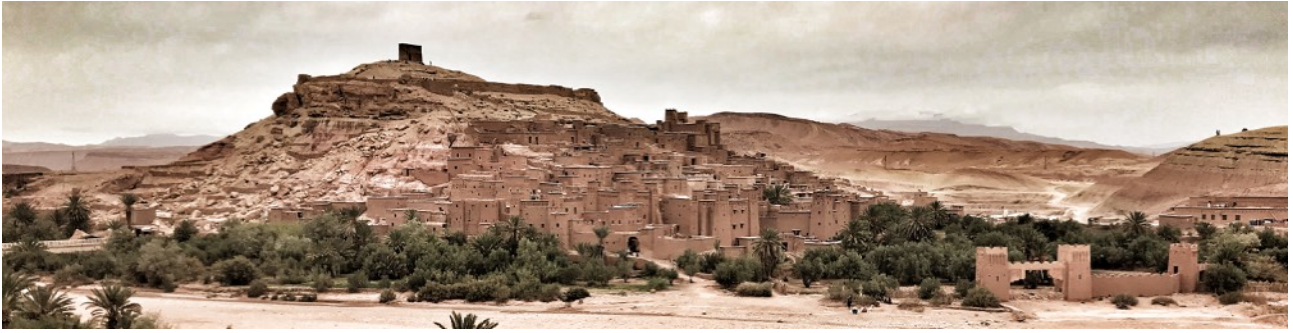
PHOTO: UNESCO World Heritage Site of Ksar Ait Ben Haddou