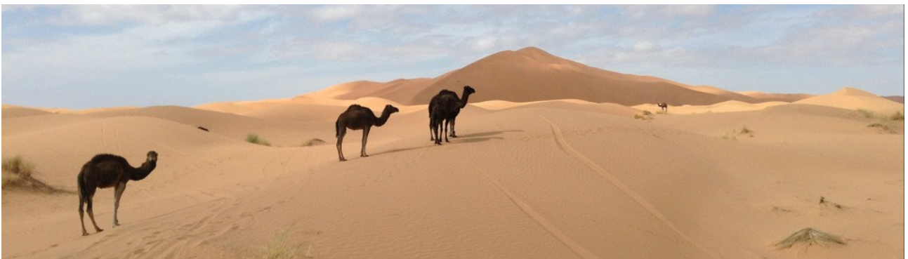
PHOTO: Erg Chebbi Dunes, Sahara

Accommodation on HB to include dinner and breakfast.